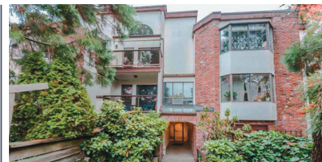
FAIRVIEW - STANFORD COURT 307 – 1775 W 10th $675,000

Five Waterfront Lots + a 6th Lot located behind that is on 33 Acres all being sold individually by same owner (Six PID's) – FIRST TIME ON THE MARKET. Rare opportunity to live on spectacular Anstey Arm at an affordable price.