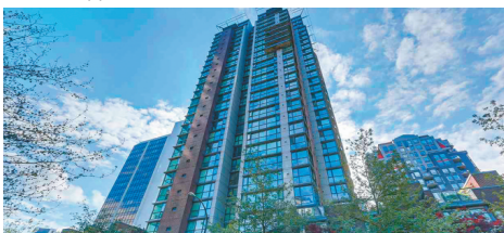
"THE CANADIAN" 3106 – 1068 Hornby $869,000

This NE facing 590 sf 1 bed + Den offers a flawless floorplan, new engineered HW floors, granite counters & city view. Only 1 block from the world class shops of Robson St.