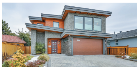
LUXURY WHITE ROCK HOUSE 1166 Keil Crescent $2,380,000

我们将竭诚为您提供最优质的服务。请致电我们的经纪人：Rayna Yu 778 709 8066