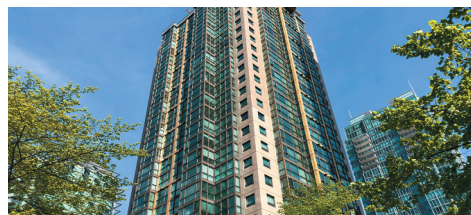
THE LIONS EAST TOWER 2001 – 1331 Alberni Street $625,000

4,500 sf Villa with 6 bed, 7 baths on prestigious SW Marine Dr. Finished to the highest of standards, quality including extensive use of Limestone outside tiles, over-height 10 ft ceilings in basement and main. Bonus 3 car garage and pad parking.