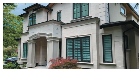
BRAND NEW ITALIAN BUILT VILLA 1695 SW Marine Drive $5,990,000

This luxurious suite is 1492 s/f with 2 baths, 2 lg Beds + Den + office w/GREAT N/W VIEWS OF Coal Harbour, North Shore Mountains & ENGLISH BAY. 9' floor-to-ceiling Windows, European cabinetry & chef's kitchen w/top of the line appliances.