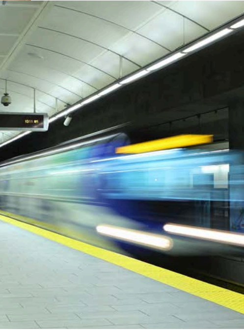
Langara 49th Station