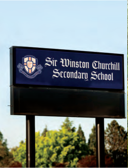
Sir Winston Churchill Secondary