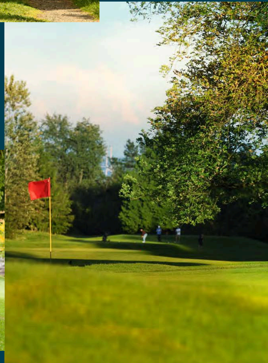
Langara Golf Course