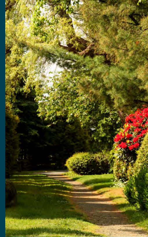
Langara Walking Trails - 2.7 km

Langara Golf Course is located directly across from your home. The 18-hole course, established in 1926, is enjoyable yet challenging for players of all levels. Surrounding the course is the Langara 2.7km walking trail. Tree-lined and serene, it offers a peaceful space for a quiet morning stroll. Tisdall, Oak, Cambie & Winona Parks are all a short walk away and provide pleasant green space, playgrounds and sports fields for team based activities.