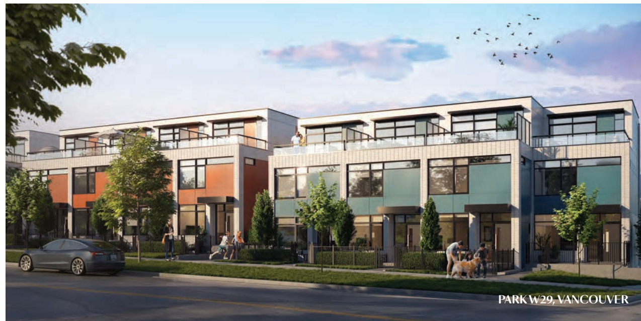
PARK W29, VANCOUVER