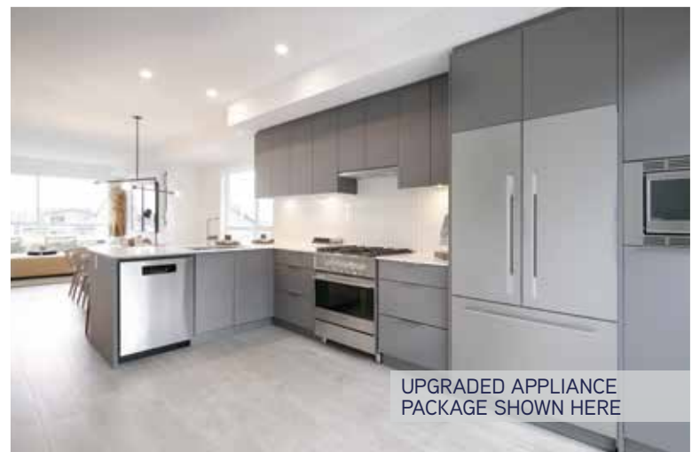
UPGRADED APPLIANCE PACKAGE SHOWN HERE