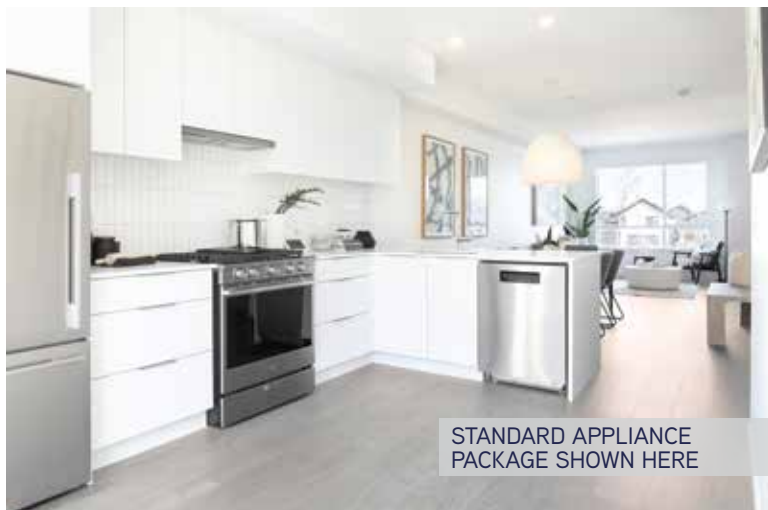
STANDARD APPLIANCE PACKAGE SHOWN HERE

THE CLASSIC SERIES IS CLASSIC IN NAME ONLY. WE FOCUSED ON HOW TODAY'S FAMILIES LIVE, AND DESIGNED THESE HIGH-VALUE SPACES ACCORDINGLY.