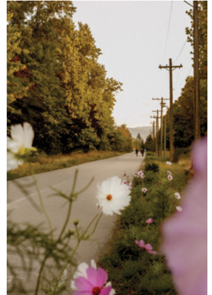
THE ARBUTUS GREENWAY IS ONE OF THE LONGEST LINEAR URBAN PARKS IN THE WORLD.

Stroll through the Arbutus Greenway, a world-class urban park connecting the Fraser River to False Creek. Explore the comforts of Kerrisdale with artisanal cafés, gardens, bike paths and community spaces that enrich the park and your daily routine.