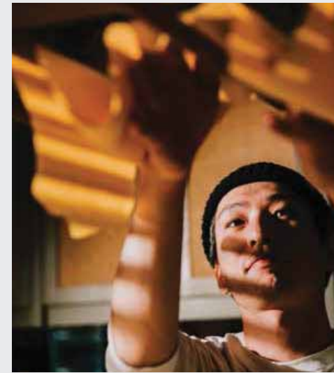
Caffè La Tana