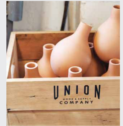
Union Wood Co