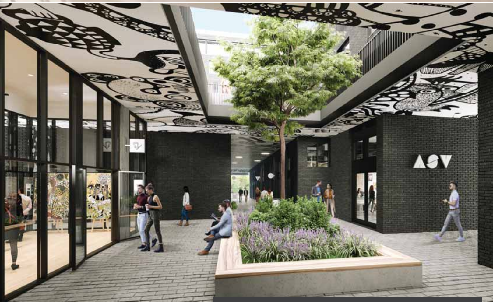
Artistic Rendering of the common Mews / Artwalk / Courtyard