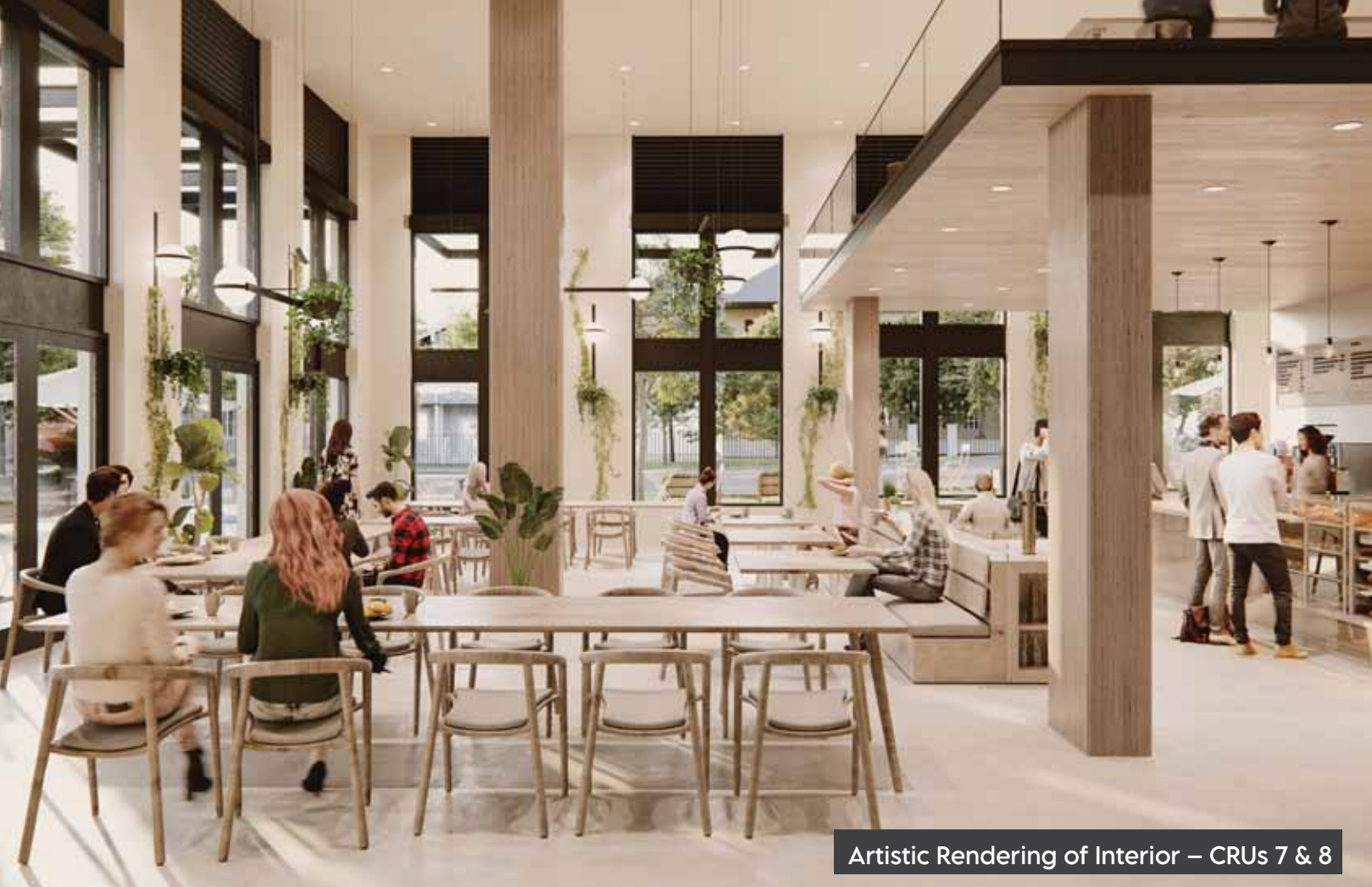
Artistic Rendering of Interior – CRUs 7 & 8