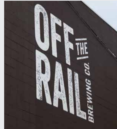
Off The Rail Brewing