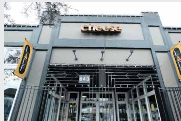
Les Amis du Fromage