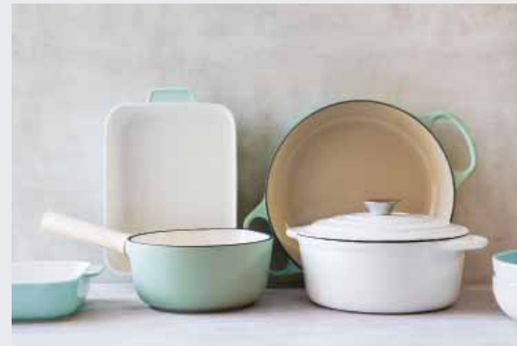
The Gourmet Warehouse