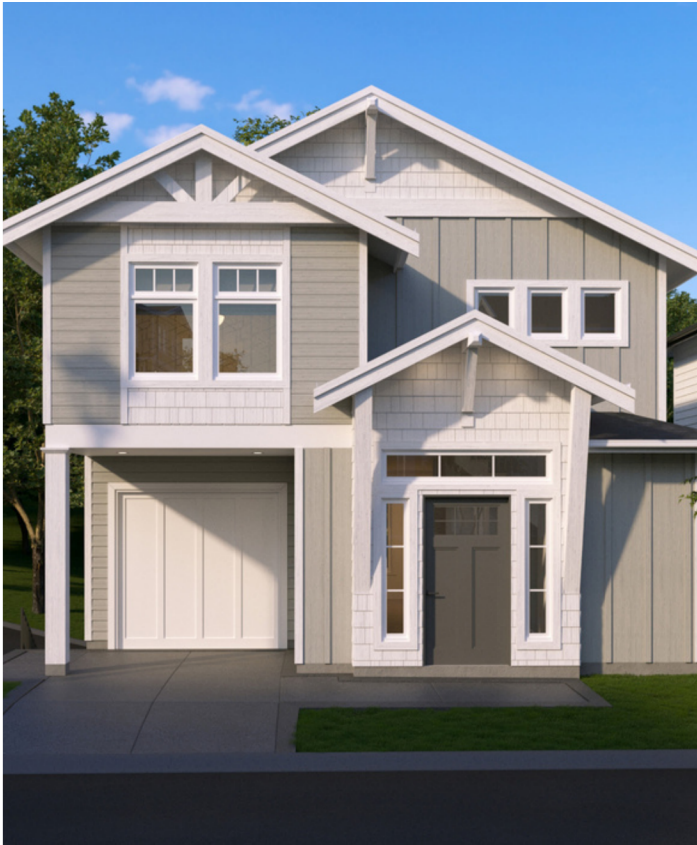
THE HEIGHTS, LANGFORD