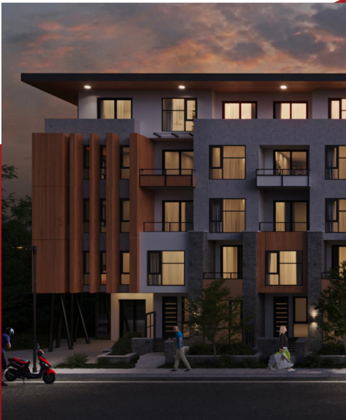
HALVÖ, SOUTH SURREY