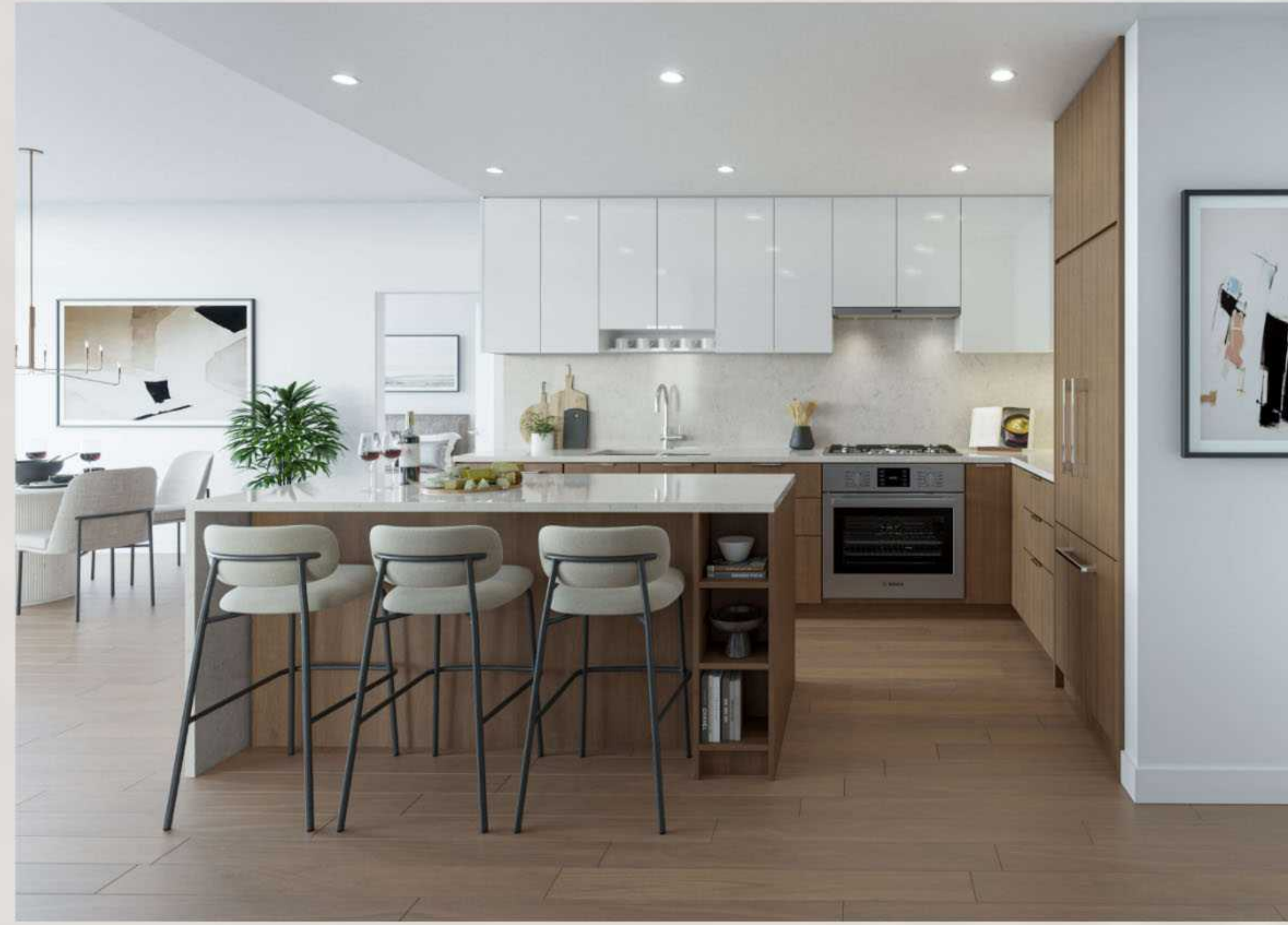
Kitchen | Haven Scheme