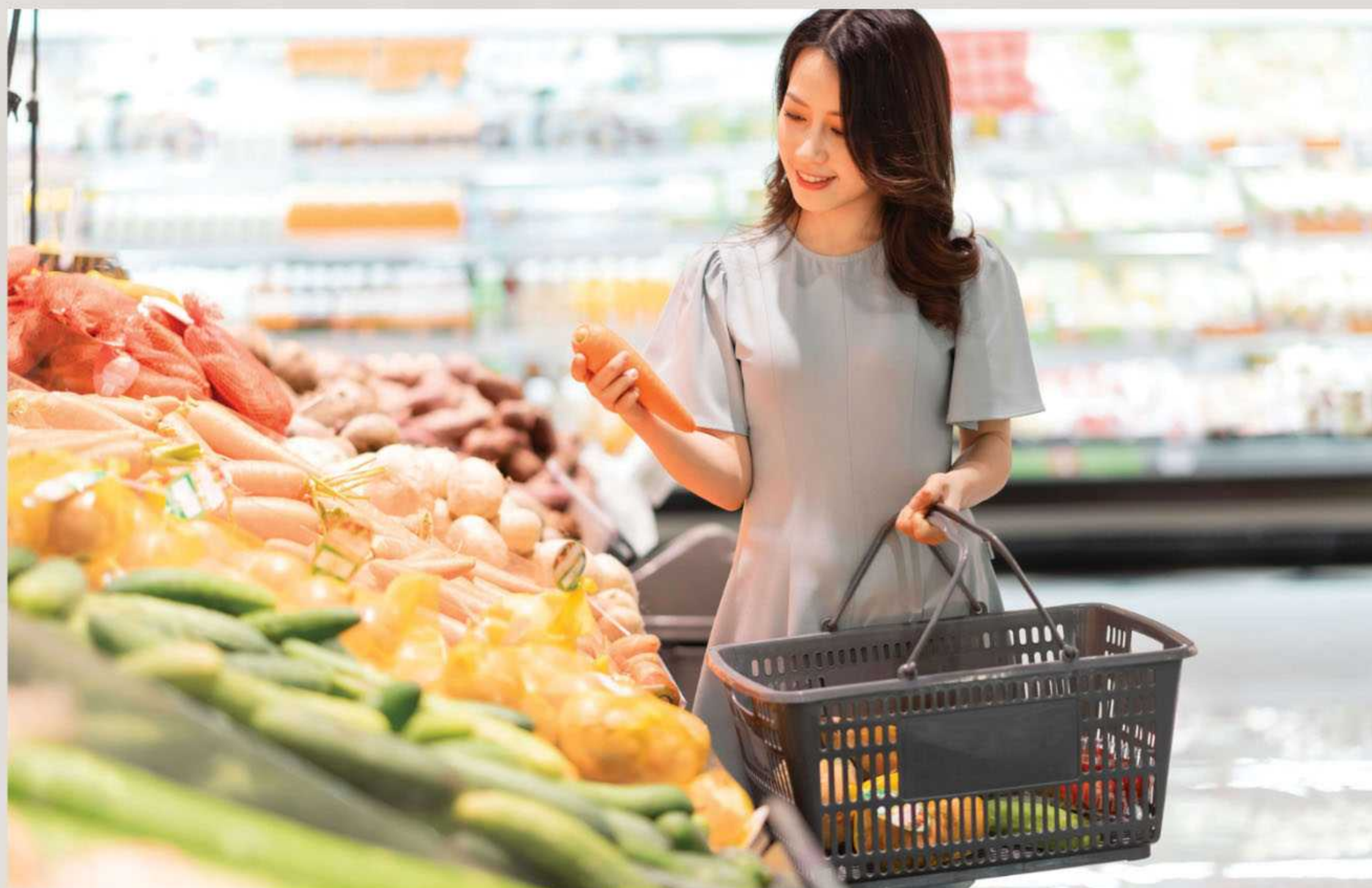
Local Grocery Store