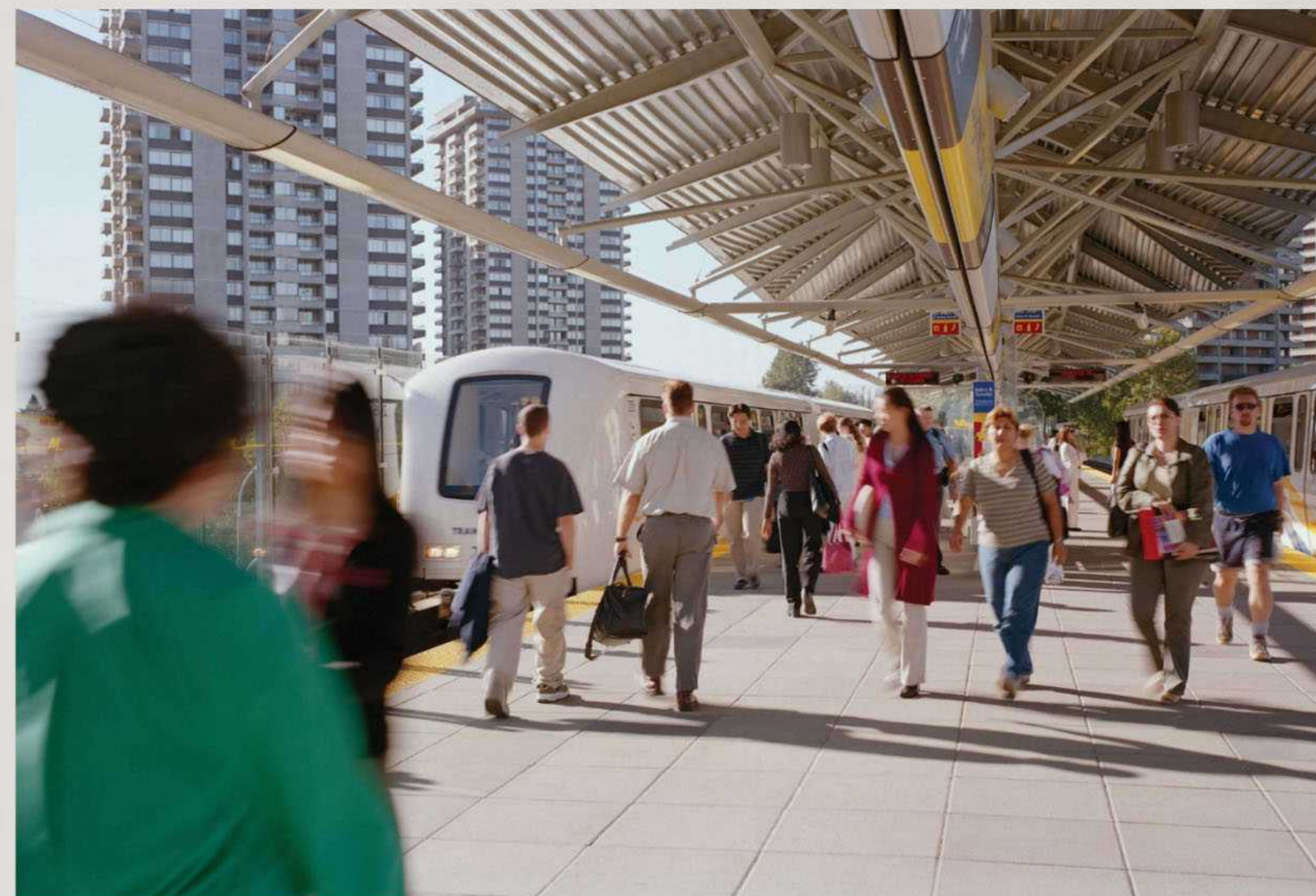
Edmonds SkyTrain Station