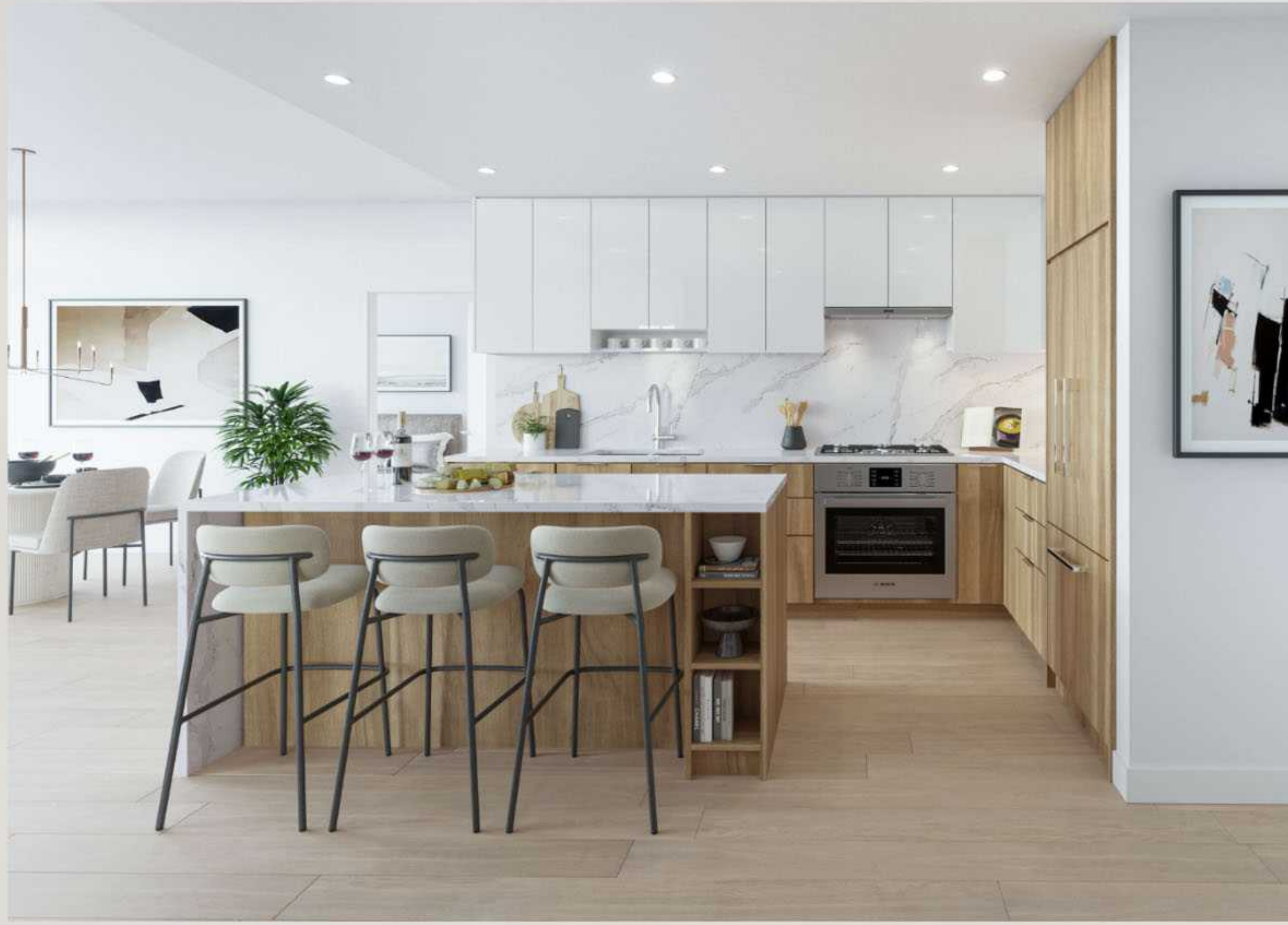
Kitchen | Oasis Scheme