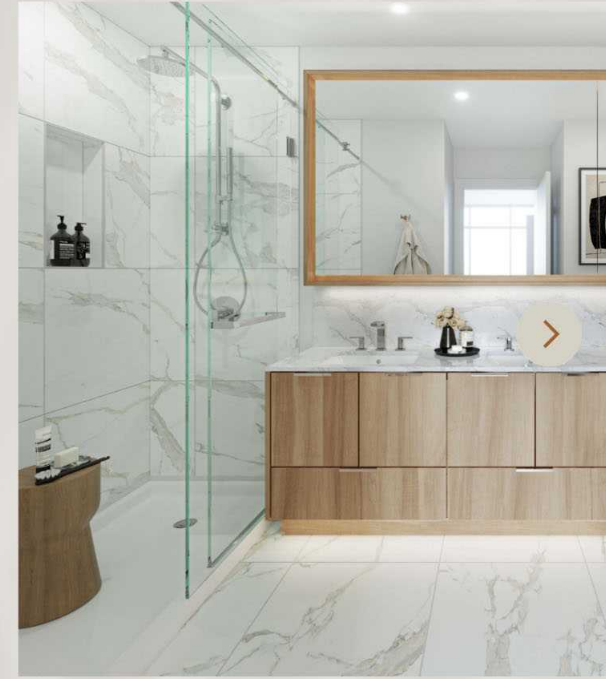
Ensuite | Oasis Scheme