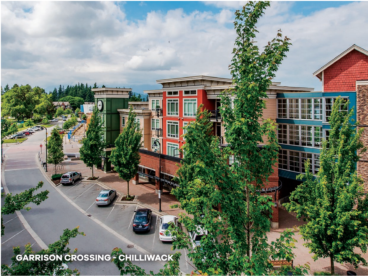
GARRISON CROSSING - CHILLIWACK