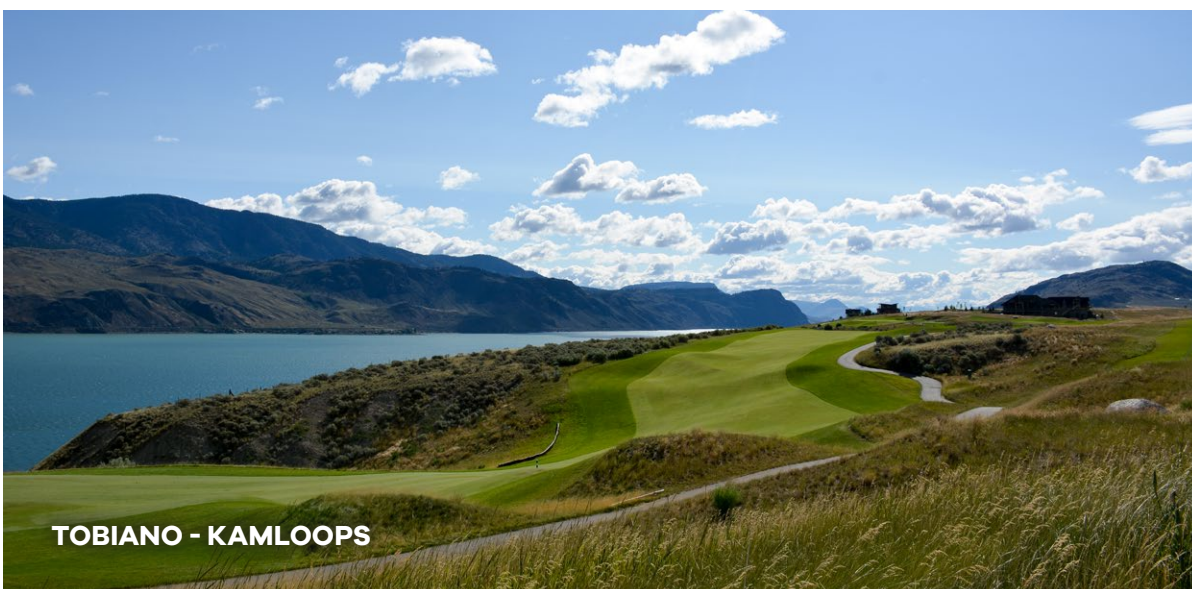
TOBIANO - KAMLOOPS

WITH EACH AMBITIOUS PROJECT, WE CONTINUE TO BUILD OUR PASSION FOR IMPROVING THE WAY PEOPLE LIVE.