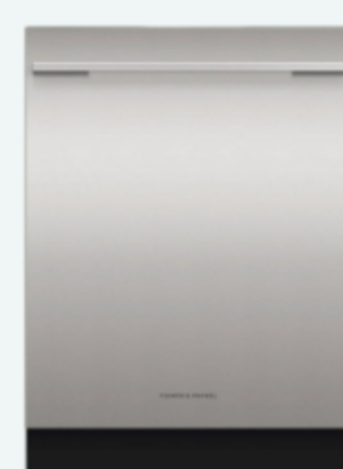
Dishwasher Fisher & Paykel 24" Dishwasher