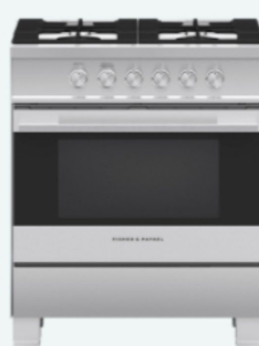
Range Fisher & Paykel 30" Gas Range