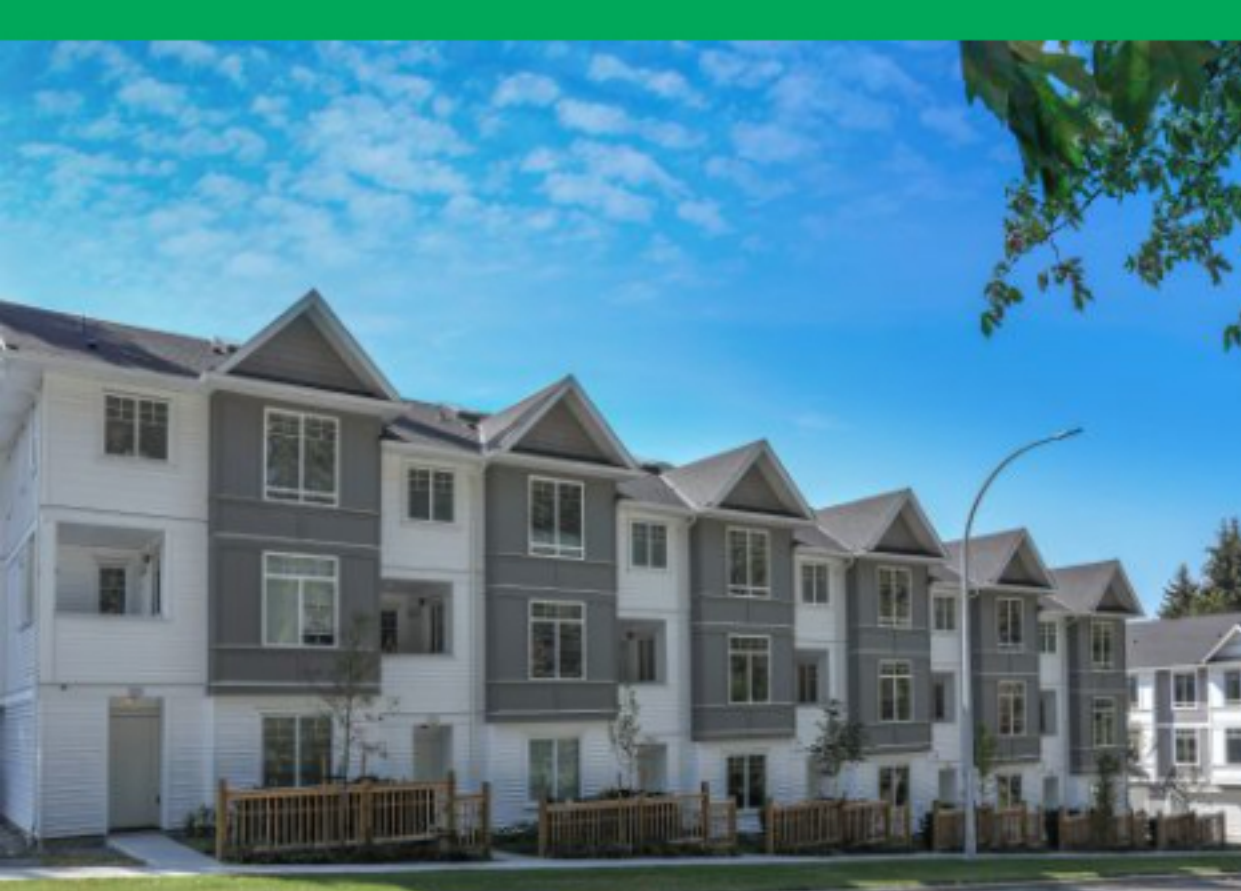
PHOENIX HILL, SURREY