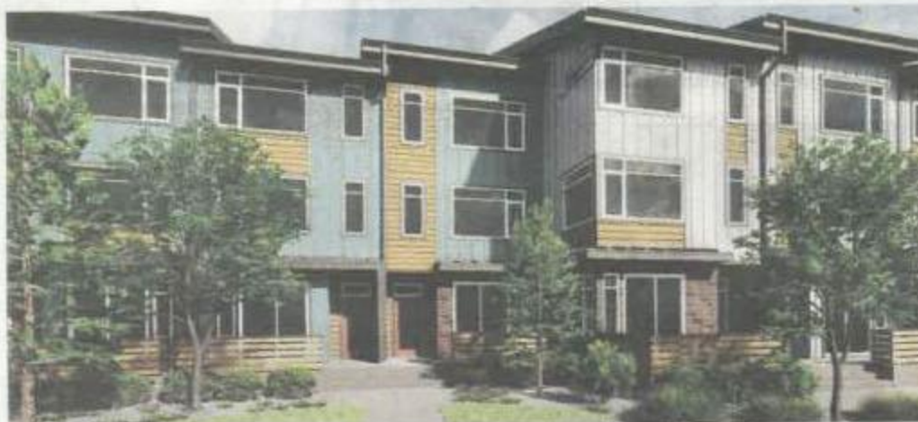
The 50-unit Ridge development by Juniper West in Kamloops is a collection of three-level townhomes.

Juniper West offers easy access to outdoor recreation with panoramic views