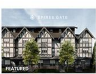
BRIGHOUSE VILLAGE, RICHMOND Spires Gate Sales from $502,000