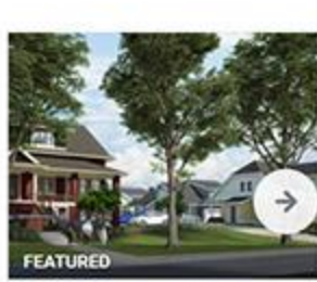
MURRAYVILLE, LANGLEY CITY Reunion Sales from $889,900