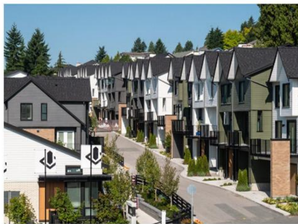
March 2020 - Phase 1 Moving Day