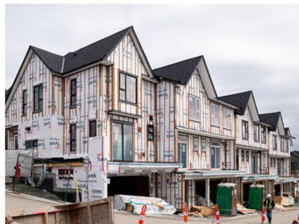
April 2020 - Phase 3