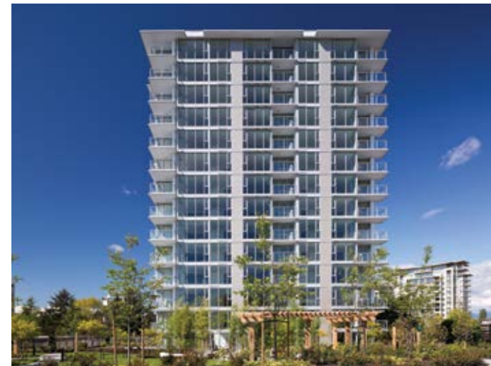
Harmony - Richmond