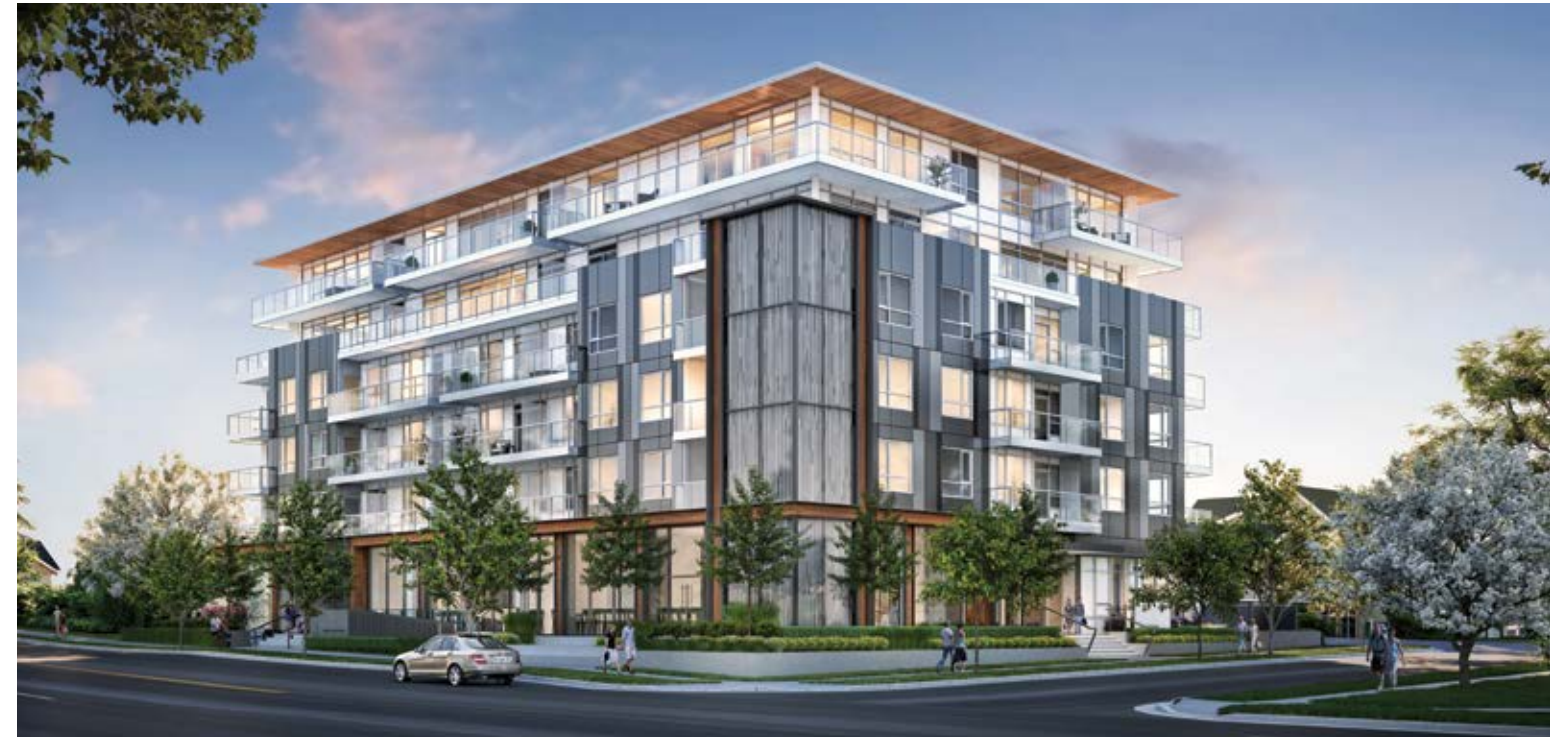
The Parker - Vancouver