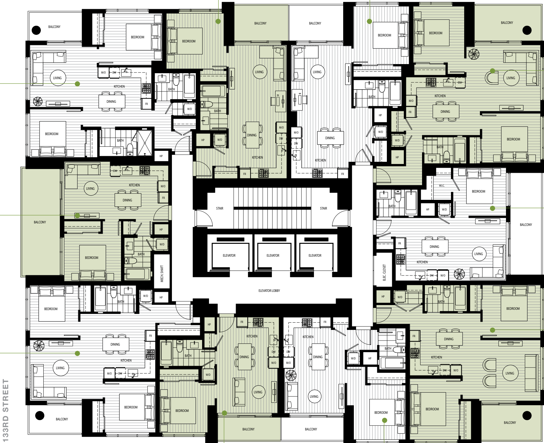
05 PLAN A2a 1 BEDROOM Interior 497 Exterior 54