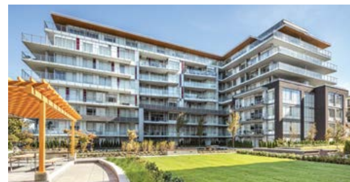
Calla at the Gardens - Richmond