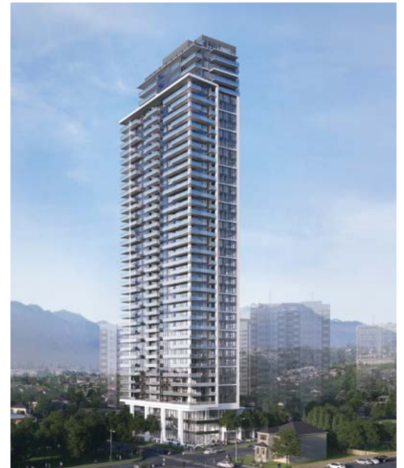
Sussex - Burnaby