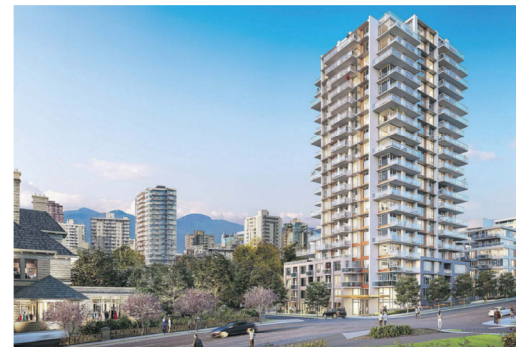
Davie and Nicola is a project from Vivagrاند Developments in Vancouver.

Building amenities include a gym with cardio equipment, and a social gathering area, landscaped and illuminated communal patio with barbecue, seating and dining areas and a hotel-inspired grand entry lobby and library lounge, and full concierge service.