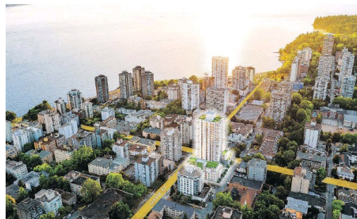
An artist's rendering of Davie and Nicola, which will comprise 128 one-to-three-bedroom homes in a 21-storey highrise in the heart of the West End, close to Vancouver's financial and entertainment districts.

The West End, with its proximity to English Bay, Stanley Park and the city's financial and entertainment district, has been viewed by many as a neighbourhood offering the best of all worlds.