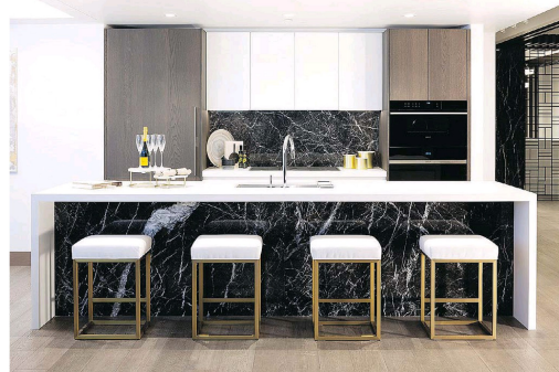
Kitchens will be fitted with top-end appliances, Kohler stainless steel undermount single sinks, recessed pot lights and LED under-cabinet accent strip lighting.