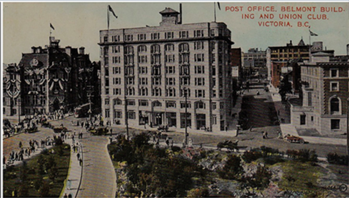
POST OFFICE, BELMONT BUILDING AND UNION CLUB, VICTORIA, B.C.

The early 20th century saw Victoria emerge as an important location in the young country of Canada. The construction of Customs House in 1914 is a prime example of the federal recognition this west coast waterfront city was attracting.