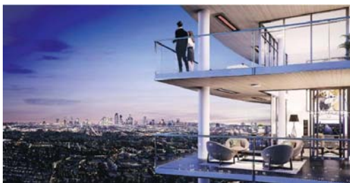
Concord Brentwood's Hillside East units, shown in an artist's rendering, feature retractable doors that create a seamless transition between indoor and outdoor spaces.

Sales centre hours: 11:30 a.m. — 5:30 p.m., daily