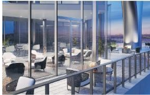
The indoor-outdoor social lounge space at Hillside East, as depicted in an artist's rendering.

An artist's rendering depicts an expansive indoor-outdoor space created by retractable doors at Hillside East in the Concord Brentwood community in Burnaby.