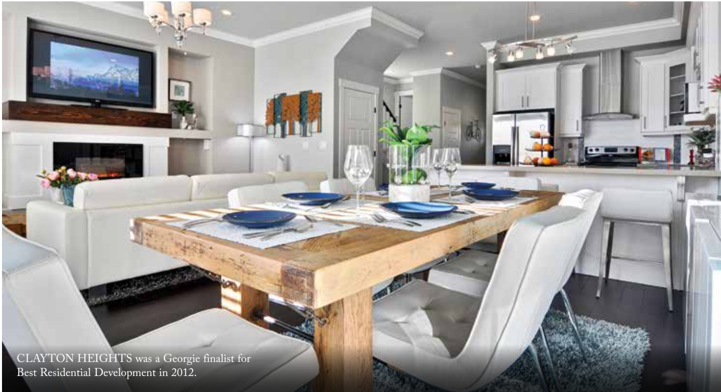
CLAYTON HEIGHTS was a Georgie finalist for Best Residential Development in 2012.

townhomes. Come fall, a special collection of 16 four-bedroom townhomes will be released at Crest, near the Langley Event Centre, offering unprecedentedly large floor plans up to 2800 square feet. Families looking to settle in the Clayton Heights neighbourhood of Surrey can register now for VIP updates on The Towne, a new community featuring 29 homes, each with double garages and high-end appliances.