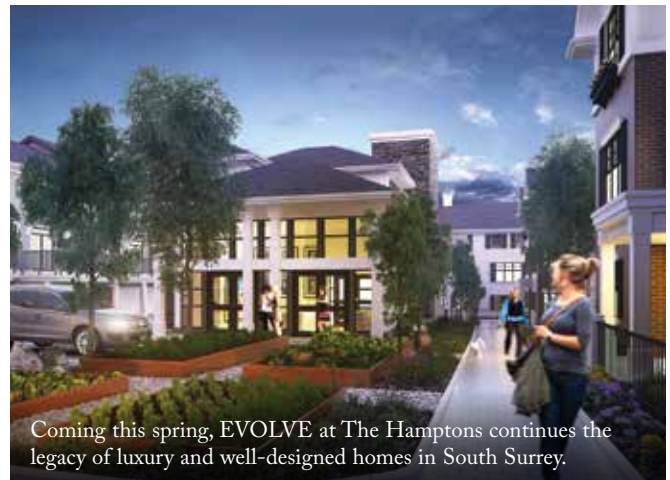
Coming this spring, EVOLVE at The Hamptons continues the legacy of luxury and well-designed homes in South Surrey.

For more information about Essence Properties and to register for their upcoming communities, visit essenceliving.com .