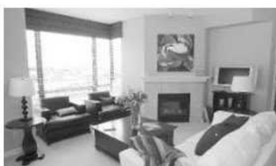
The spacious living room (above) and dining room in a Sussex House unit.