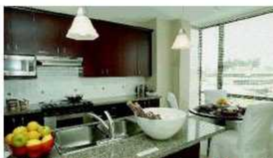
An interior shot of one of the Sussex House condos. Almost two-thirds of the 150 suites have been sold.