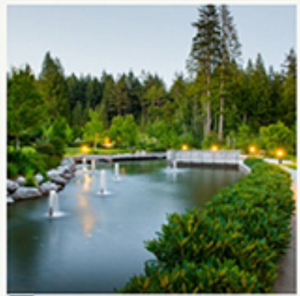
f G+1 0