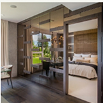
f G+1 0