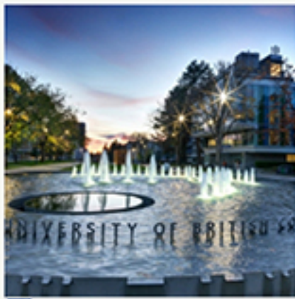
f G+1 0