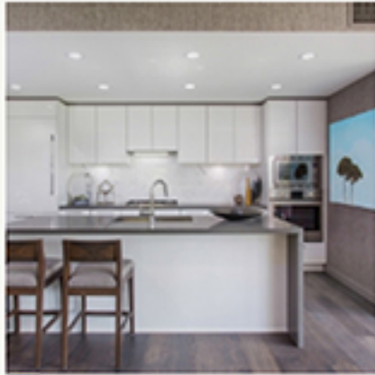
f G+1 0