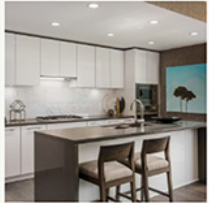
f G+1 0