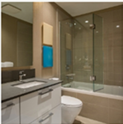
f G+1 0