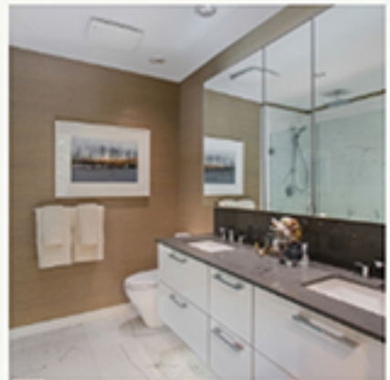
f G+1 0