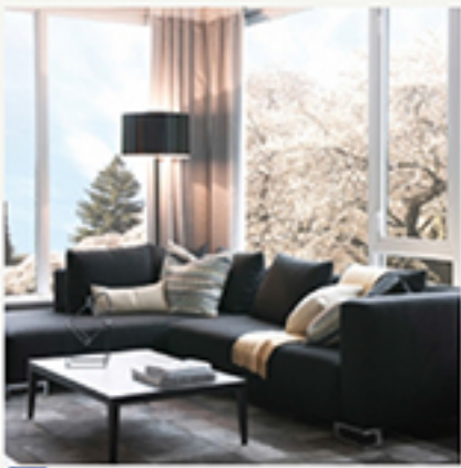
f G+1 0