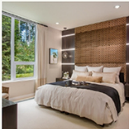
f G+1 0