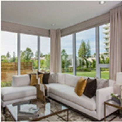
f G+1 0