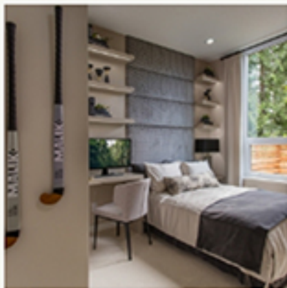
f G+1 0