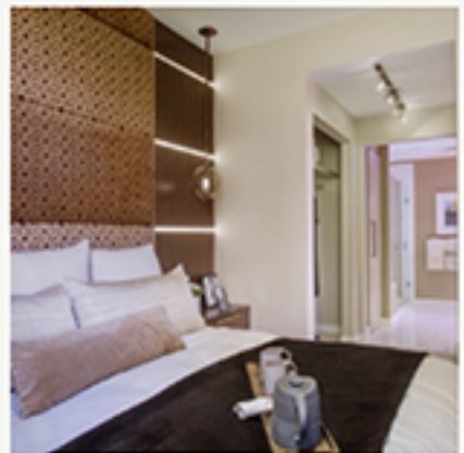
f G+1 0