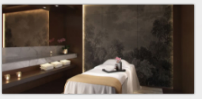
Luxury Spa, Steam, and Sauna Rooms