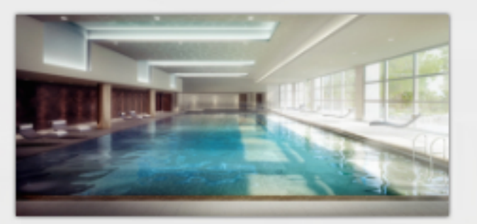
Indoor Swimming Pool with Whirlpool