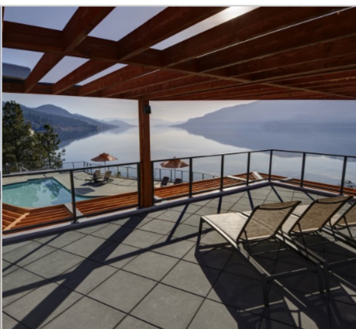
Large Private Patio With Stunning Views