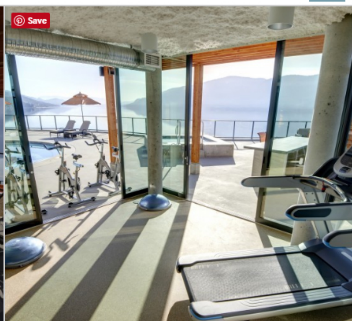
State Of The Art Gym