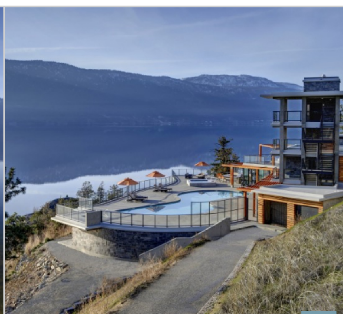
Pool With Clubhouse