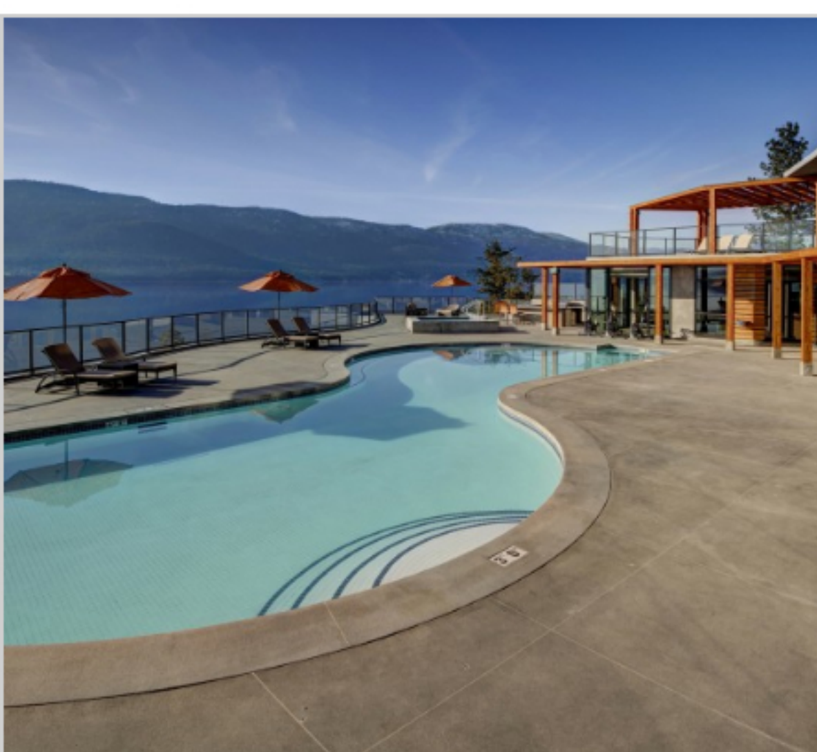
Pool and Clubhouse