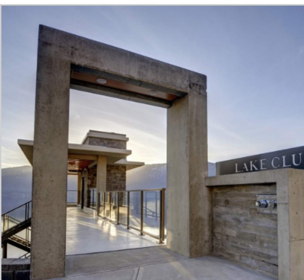
Exquisitely Built Amenities