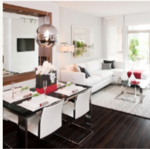
Living + Dining