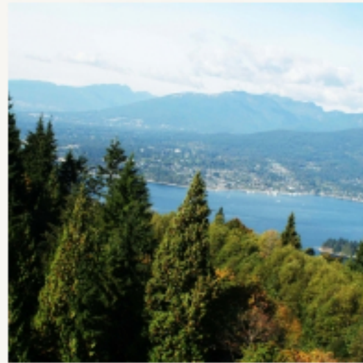
Burnaby Mountain View