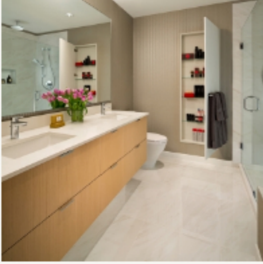
West Quay Bathroom