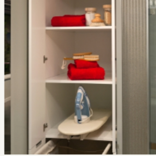
West Quay Linen Closet