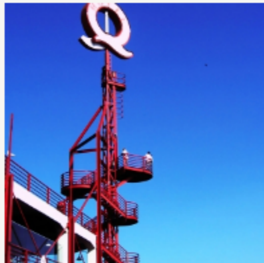
Lonsdale Quay Market