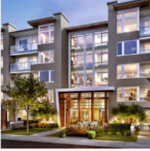
West Quay - Rendering