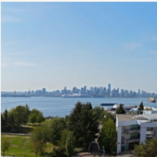
West Quay Views