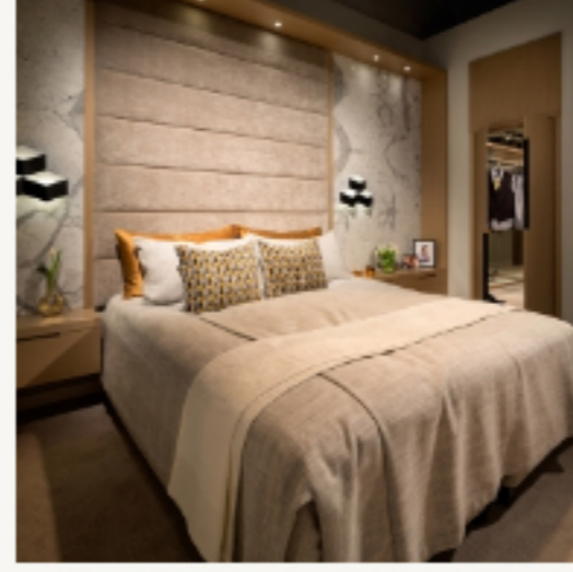
West Quay Bedroom