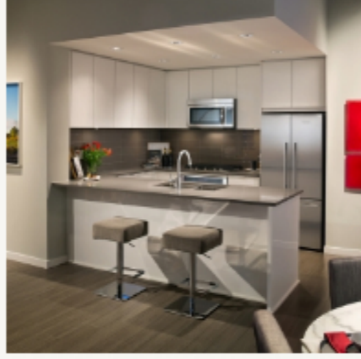
West Quay Kitchen