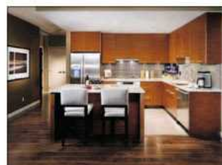
Jewel kitchens are fitted with a stainless steel appliance package, undermount sinks and under-cabinet lighting. Counters are topped with granite.