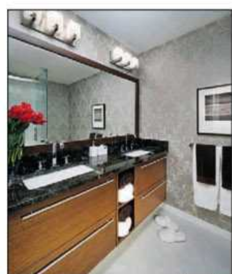
Bathrooms feature porcelain tiled walls and flooring.