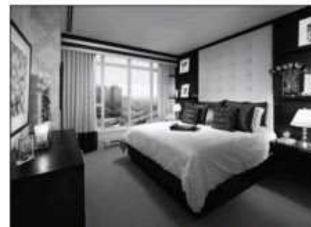
The Jewel homes are fitted with floor-to-ceiling windows designed to showcase the panoramic views. Hardwoods top the floors in the entry, living and dining areas, while bedrooms have carpet underfoot.