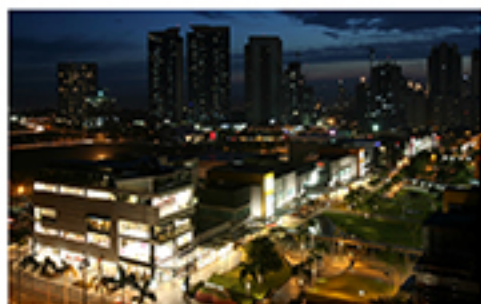
< BONIFACIO HIGH STREET | METRO MANILA >

We're a $10 billion company with a broad product portfolio and widely owned by 10,000 stockholders big and small, but we're still led by the same original family since 1834. We operate internationally but always take a local and personal approach to building homes and communities, and our project team lives and works here in Vancouver. Strong roots in business and the community are very important to us, as every neighbourhood we invest in is unique. Our work is about trust, legacy and lasting value, proven by the multiple generations of families returning decade after decade to purchase from us.