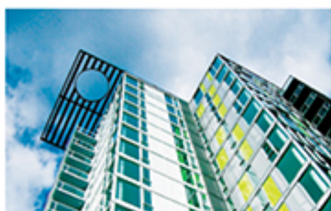
< CENTRO | RICHMOND >

But we're not different for the sake of being different. Innovation must also make good economic sense. Every creative solution we're passionate about is grounded in practical reality. It's part of our philosophy: better homes help make better lives. The desire to make things better has driven us from our inception. We create spaces that combine intelligent design with the enduring nature of genuine craftsmanship.