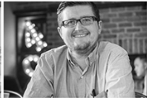
FORTY NINTH PARALLEL