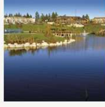
Sunstone Park and Lake