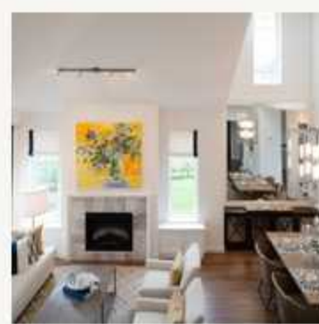
Living and Dining

Photo Gallery | Floor Plans | Map | Neighbourhood