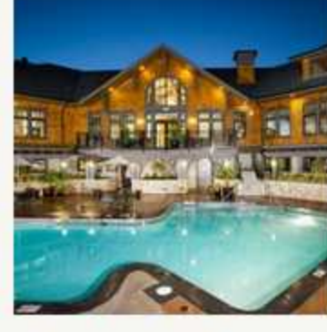
Sunstone Community Clubhouse