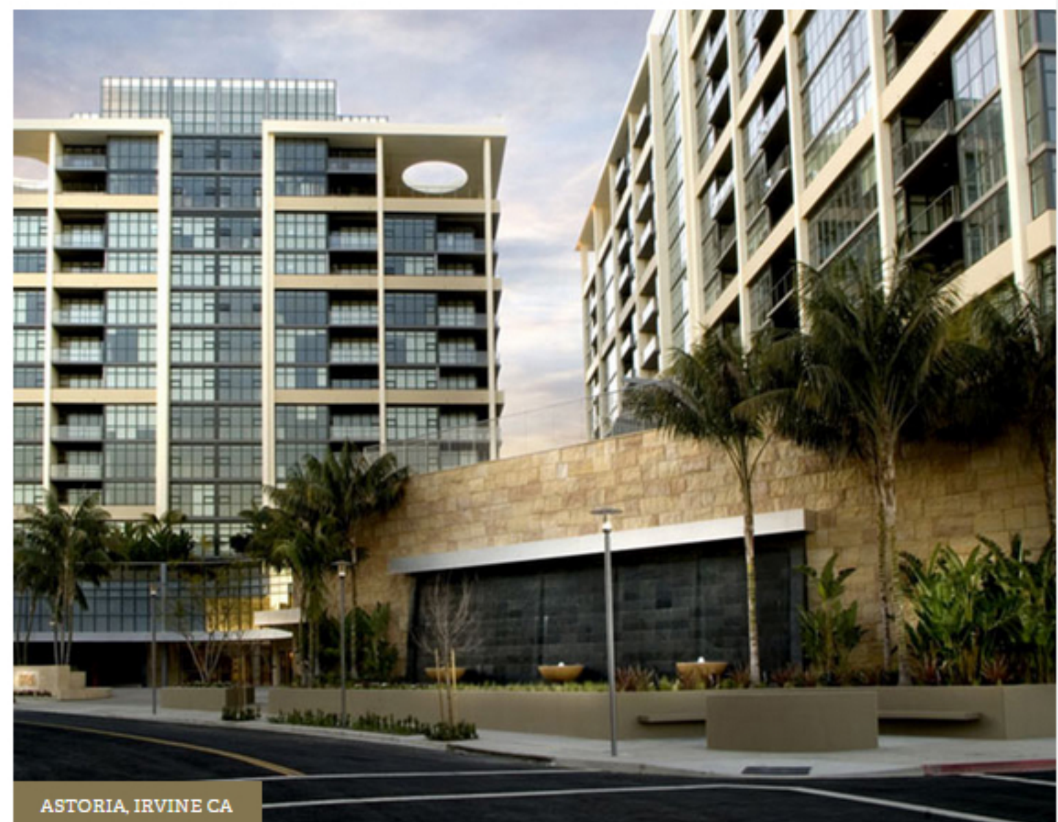
ASTORIA, IRVINE CA

EXPERIENCE HAS SHOWN US THAT IT'S EASIER TO MAINTAIN HIGHER QUALITY STANDARDS WHEN YOU DO THE WORK YOURSELF.