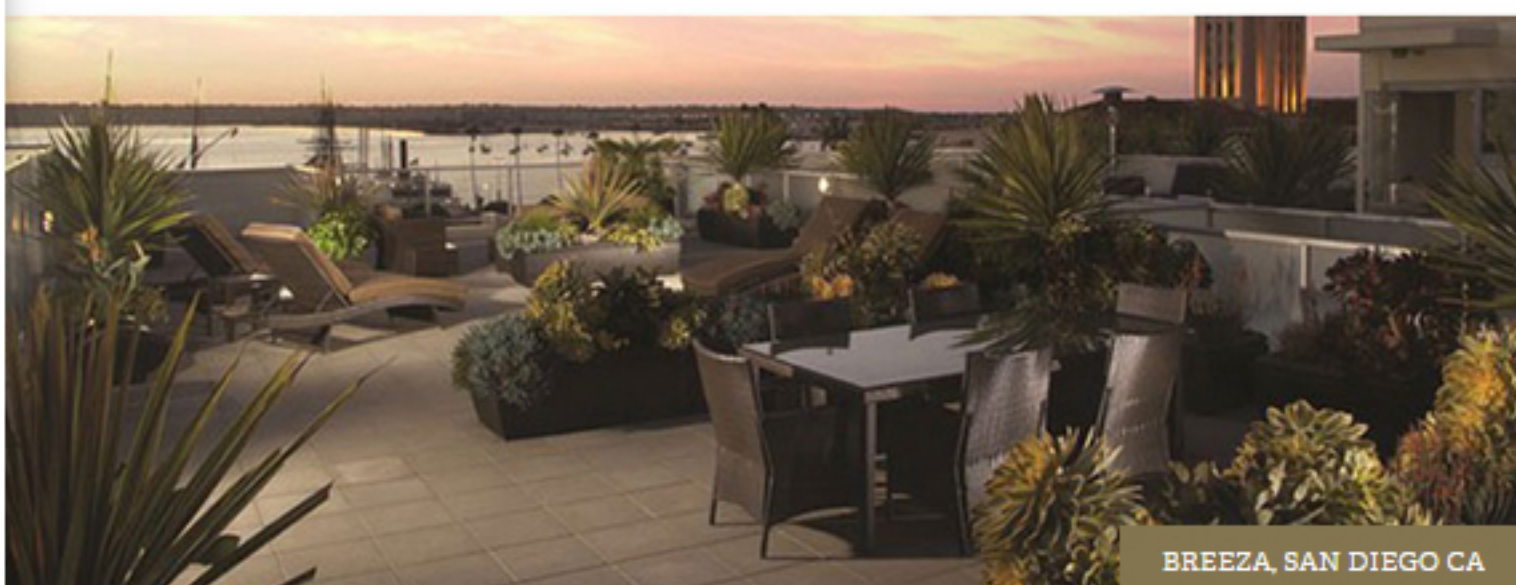
BREEZA, SAN DIEGO CA