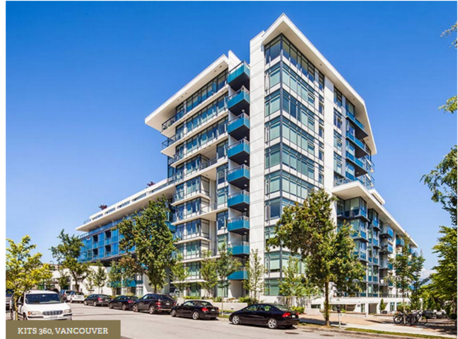
KITS 360, VANCOUVER