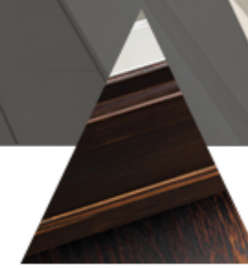
A SENSE OF SPACE