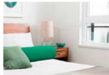
Cozy Bedroom Carpets