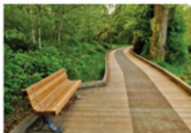
Deer Lake Park