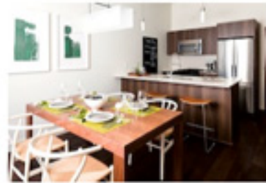
Stone Countertops and Stainless Steel Kitchen Appliances