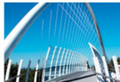
Griffiths Pedestrian Overpass