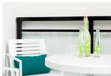
Spacious Balconies with Glass Panels