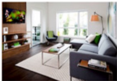
Hardwood Throughout Your Living Room