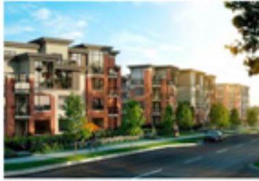
Landscaped Auto Court Entry