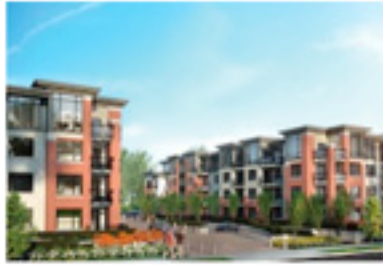
Beautiful West Coast Architecture