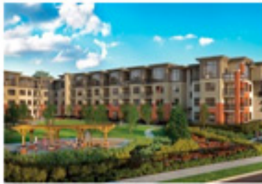
Children's Play Area and Greenspace