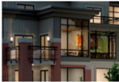
Expansive Windows and Balconies