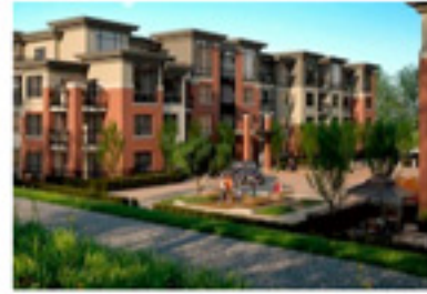
Urban Trail Next Door