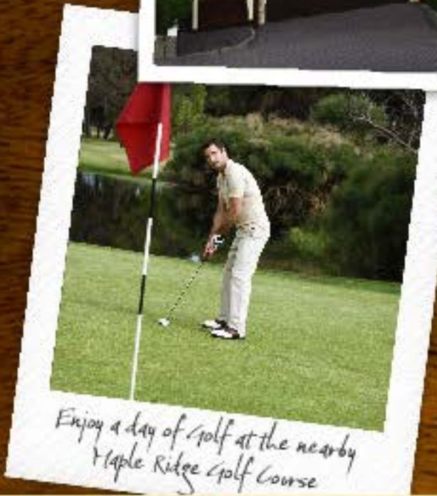
Enjoy a day of golf at the nearby Maple Ridge Golf Course

Finding a balance with all of the comforts you desire is simple. All the homes feature a West Coast Design with open and spacious three bedroom floor plans ranging from 2,089 to 2,459 sq.ft., two designer color schemes to choose from, gourmet stainless steel appliances, lighting details for gracious living, ample storage space, crown moldings and baseboards throughout.