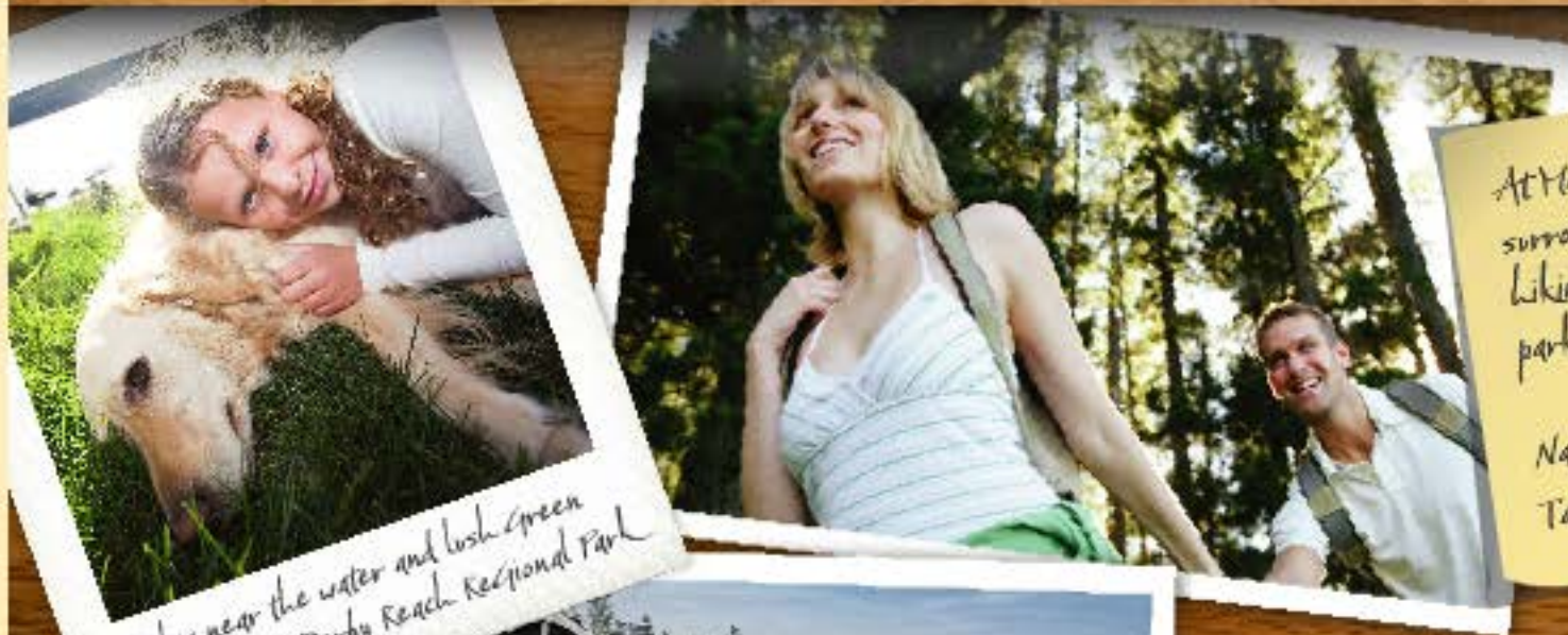
Relax near the water and lush green landscape at Derby Reach Regional Park

At Maple Creek you're surrounded by nature. Enjoy hiking through the nearby parks and trails! Nature is at your front door. Take Advantage!