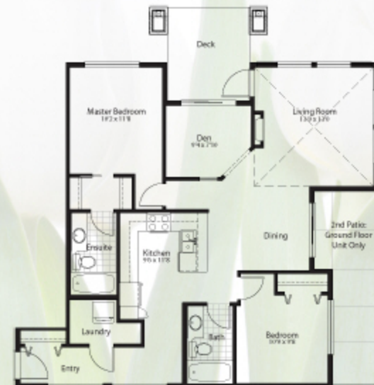
Plan G1 - Two Bedrooms + Den 1081 sq.ft. (approx.)

Click here to download PDF versions of all 2 Bedroom plans