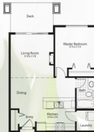
Plan A - One Bedroom 663 sq.ft. (approx.)

Click here to download PDF versions of all 1 Bedroom plans