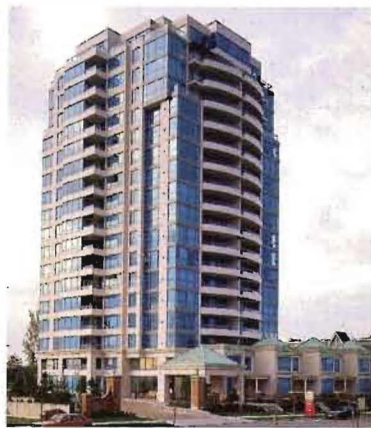
The Gibraltar sets the standard for luxury high-rise living.

The locals call Ridgemont The New Heart and Soul of Burnaby Plateau...and for good reason. Located in South Burnaby, Ridgemont is the latest community to put down roots in the neighbourhood, and it's already blooming with life. The established cornerstone is the Gibraltar, setting a standard for luxury high-rise living. The master-planned community also boasts a cluster of magnificent, finely crafted townhomes. And now Gemini. Twin towers unparalleled in quality...twenty-one storeys of new high-rise luxury condominium suites from one to three bedrooms.