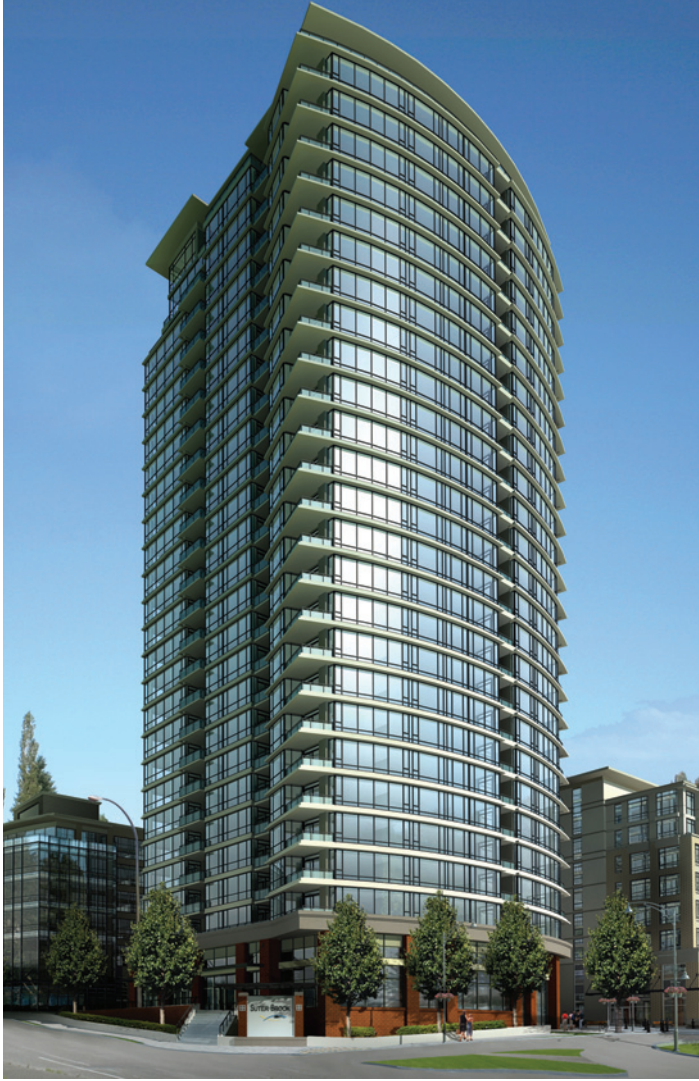
Port Moody condos in a master-planned community close to it all.