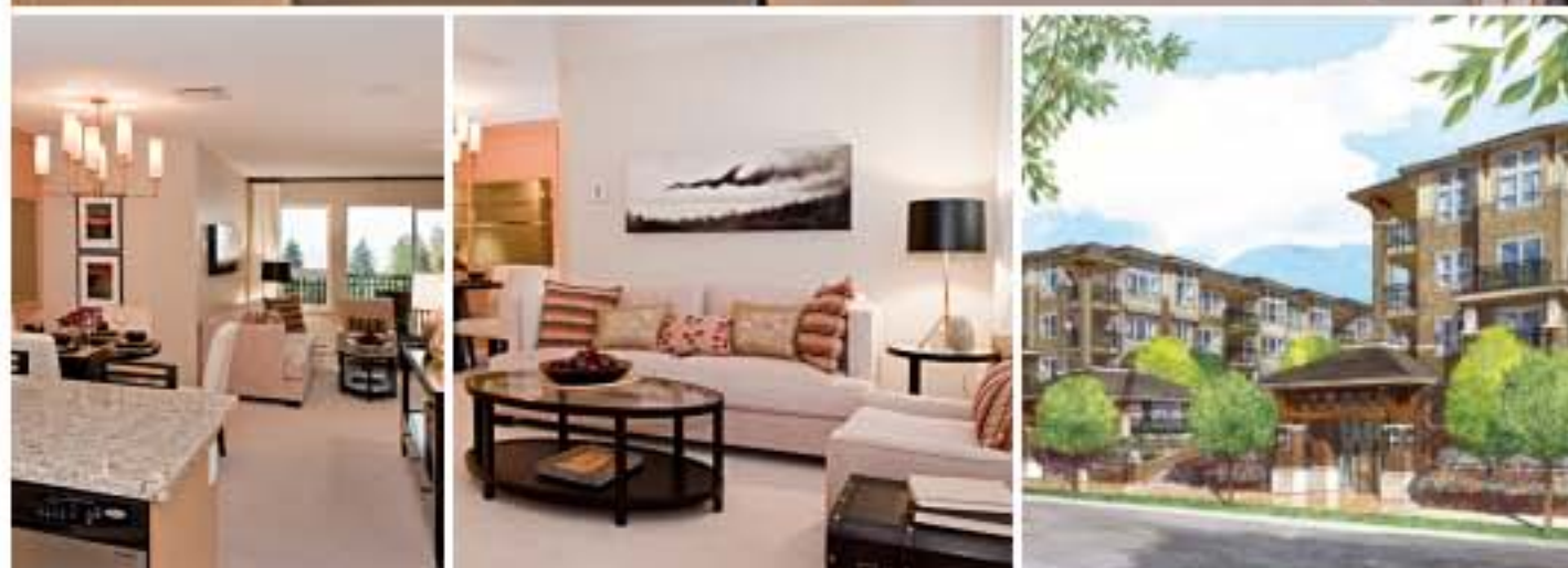
Move your cursor along the thumbnails to view additional images