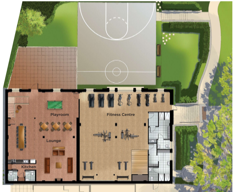
MAIN FLOOR 4,445 (approx)