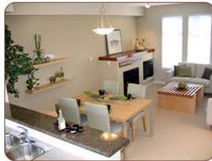
Alto - Living & Dining Rooms