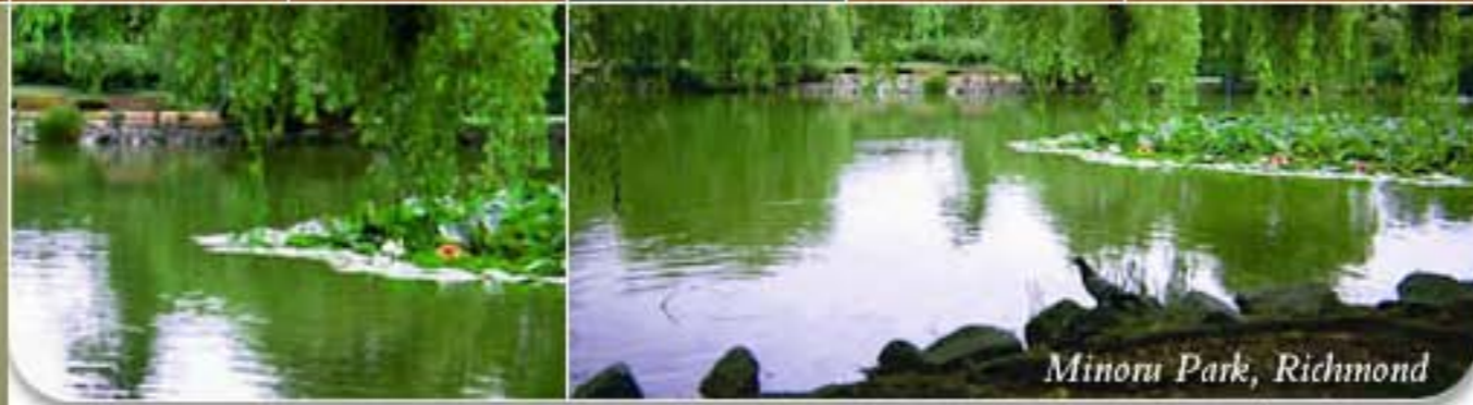
Minori Park, Richmond