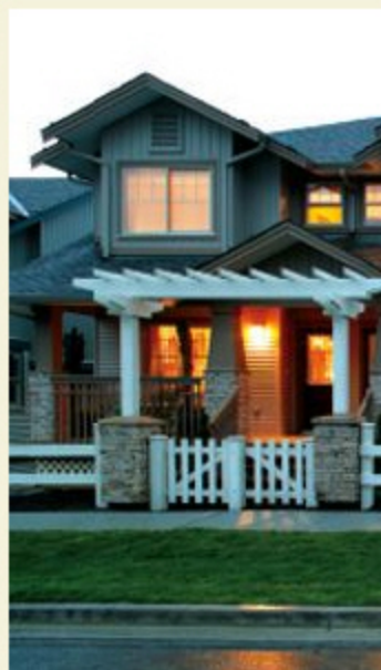
Sunberry Court, Surrey

Solterra specializes in building top-quality townhomes and highrise residences. Over the past 15 years, the team at Solterra has developed many award-winning multi-residential communities throughout the Lower Mainland. We understand the importance of a "home" and pride ourselves on creating residences that feature exceptional design, solid construction and quality finishes.